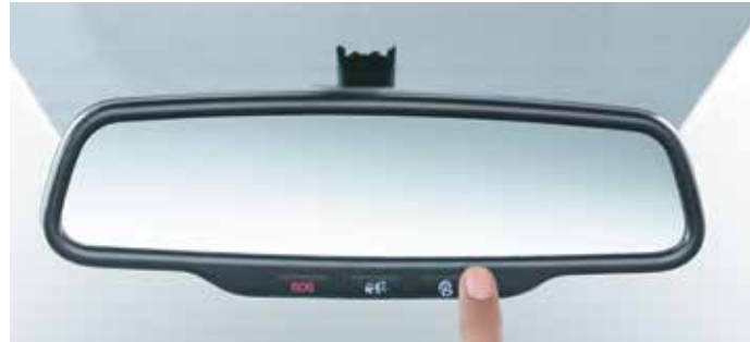
Electro chromic mirror - IRVM with Blue Link switches