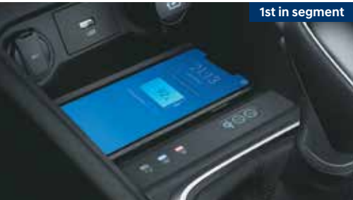
Wireless phone charger^