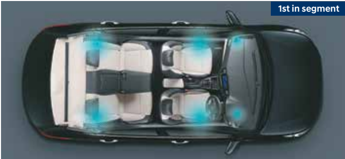
Arkamys premium sound with front tweeters, front & rear speakers

Blue Link features: Hello Blue Link | Remote engine start/stop** | Remote climate control (AC) with engine start** | Cricket scores Push maps by Blue Link connect centre | Tyre pressure information | SOS/emergency assistance | RSA (Road side assistance) Interactive voice recognition | Fuel level information | Dial by number | Indian holidays information | Remote door lock/unlock