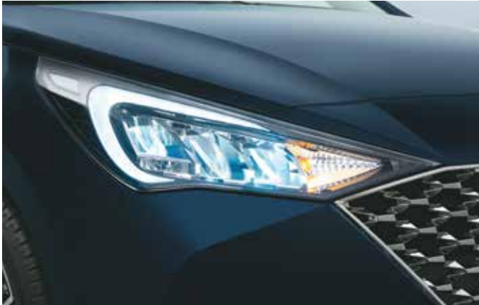
Full LED headlamps