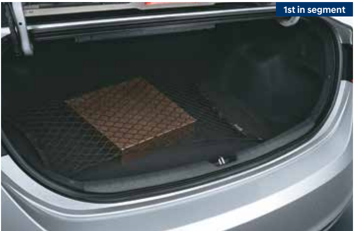
Luggage hook & net