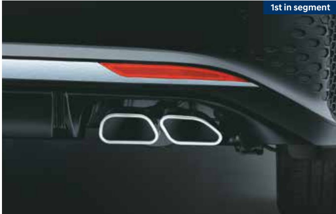
Twin tip muffler (turbo)