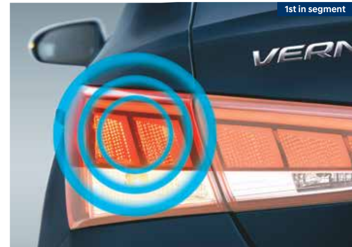
Emergency stop signal (ESS)

Other features: Speed sensing auto door lock | Impact sensing auto door unlock | Strong body structure 73% (AHSS + HSS) | Rear parking camera with dynamic guidelines | Headlamp escort function | Automatic headlamps | Vehicle stability management (VSM) | Electronic stability control (ESC) | Hill start assist control (HAC)