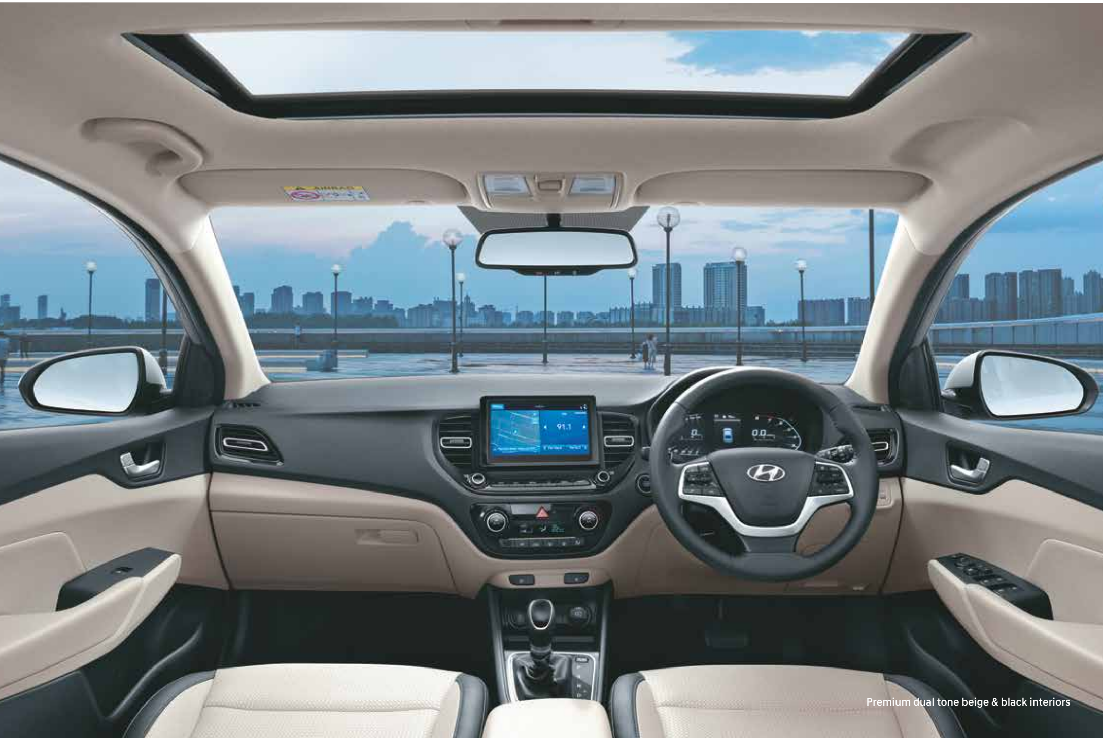
Premium dual tone beige & black interiors