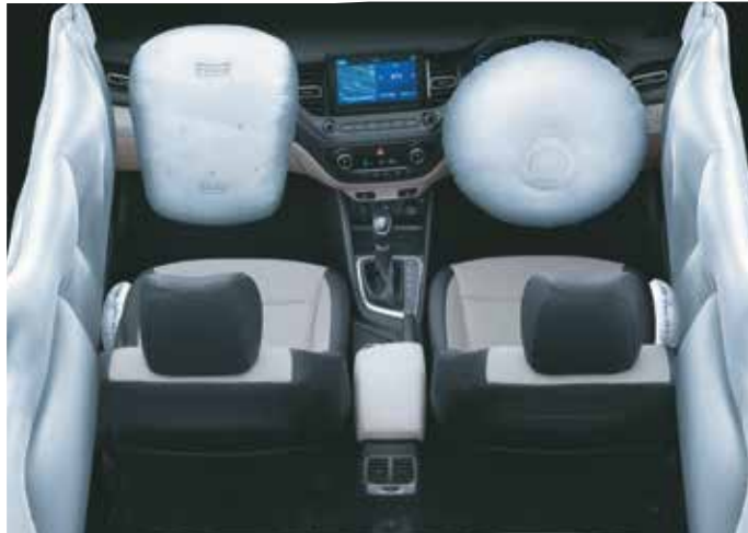
6 airbags (driver, passenger, front side & curtain)