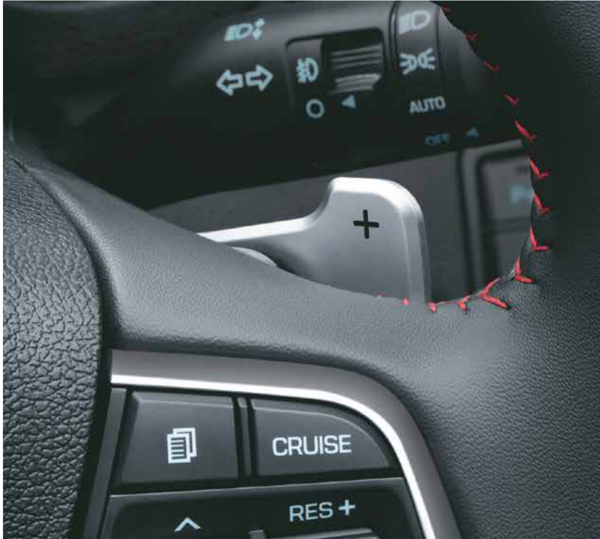
Paddle shifters (turbo)

The spirited new VERNA is not just all looks. Pop open the hood and you'll know what it's all about. With exciting new engine variants, transmission options and brand new paddle shifters (turbo), experience the power of the spirited new VERNA as you charge ahead and take control of the city roads.