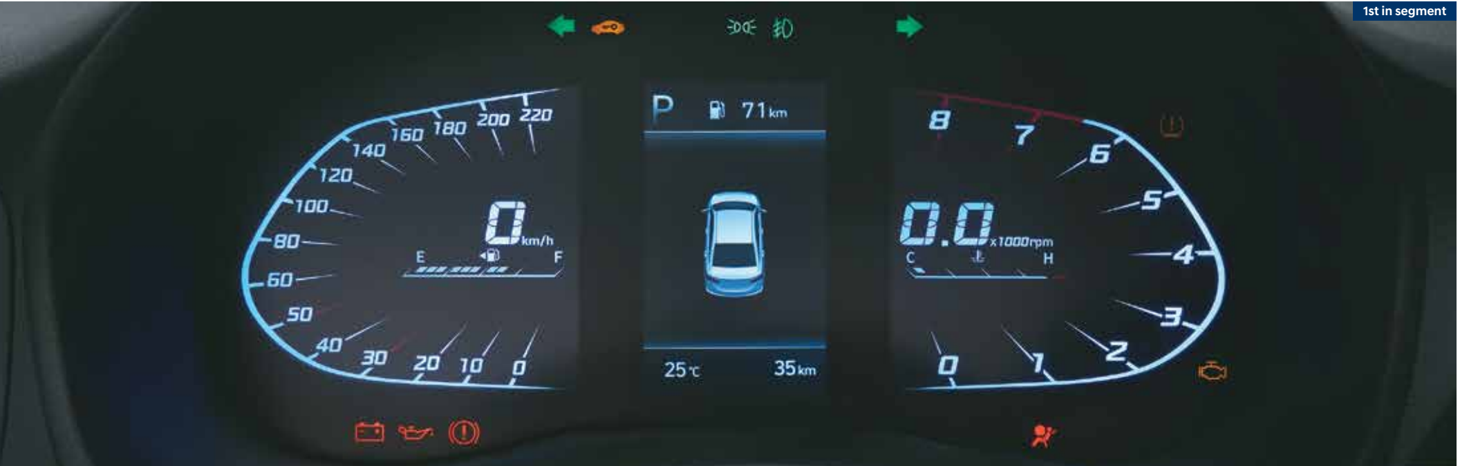
Digital cluster with 10.67 cm (4.2") colour TFT MID

The spirited new VERNA has a ton of features customised to satisfy all your needs. The ingenious new smart trunk to pack all that you love without putting a finger on the boot. Front ventilated seats to keep you cool even in the hot Indian summer. An electric sunroof and a wireless charger to maximise quality time while travelling.