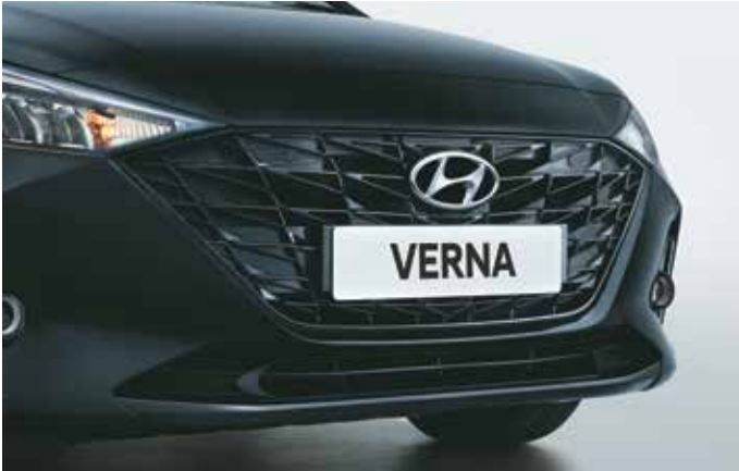
Glossy black front radiator grille (turbo)