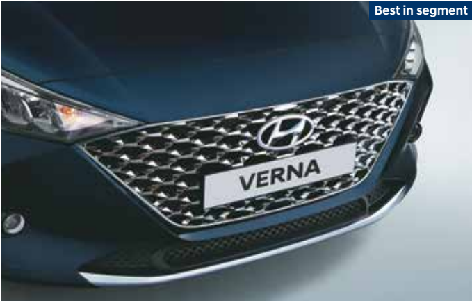
Dark chrome front radiator grille

Take a walk around the spirited new VERNA and be charmed by its exquisitely crafted sensuous sporty design and mesmerising front grille. Observe its new full LED headlamps, LED tail lamps and the twin tip muffler (turbo). Let its sporty R16 diamond cut alloy wheels sweep you off your feet.