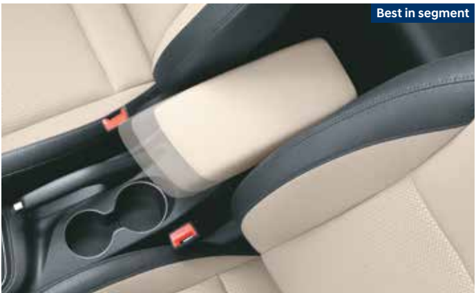
Sliding front centre console armrest with storage

Other features: Leather* upholstery | Rear centre armrest with cup holder | Rear manual curtain | Leather* wrapped steering wheel Leather# wrapped gear knob