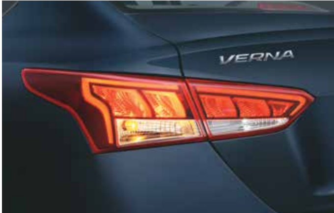
LED tail lamps