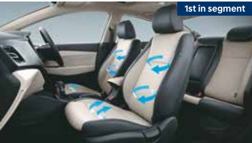
Front ventilated seats