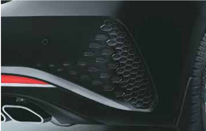
Sporty bumper design (turbo)