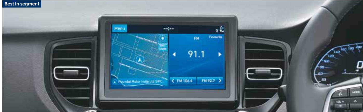
20.32 cm (8") touchscreen AVNT with HD display