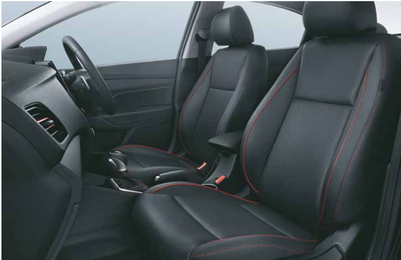
All black interiors with red accents (turbo)

Experience the touch of finesse every time you take a seat in the spirited new VERNA. The new premium dual tone beige & black interiors and all black interiors with red accents (turbo) lend a classy vibe to the cabin, designed to match your killer instinct.