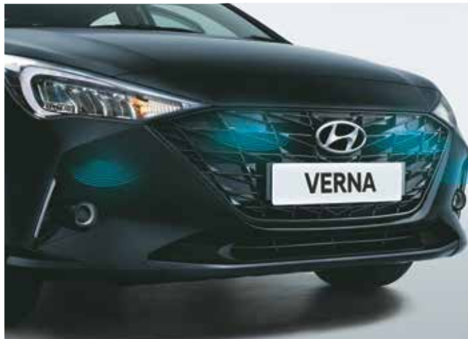
Front parking sensors (turbo)